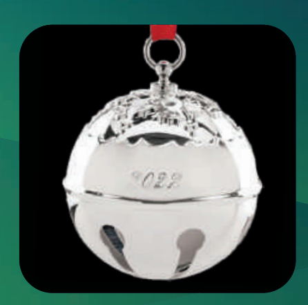
Reed & Barton 2022 Silverplated Holly Bell Giving Level: $1000+