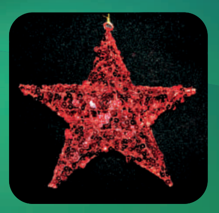
XL Red Sequin Metal Star Giving Level $500 - $999