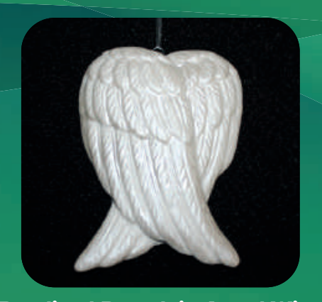
Pearlized Porcelain Angel Wings Giving Level $100 - $249