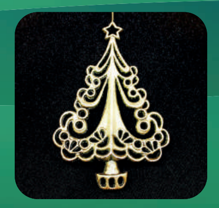
Antique Gold Tree Giving Level $25 - $49