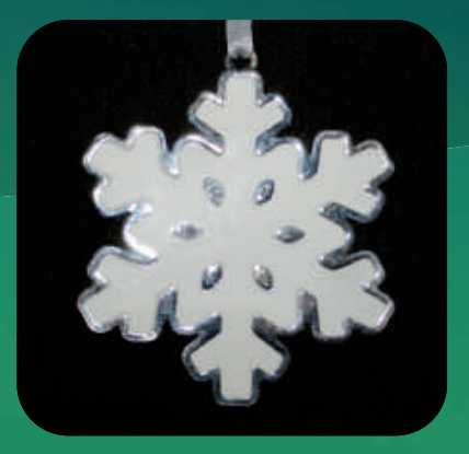
Premium Enamel Snowflake Giving Level $50 - $99