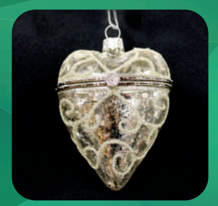
Gold Glass Heart Box Giving Level $250 - $499