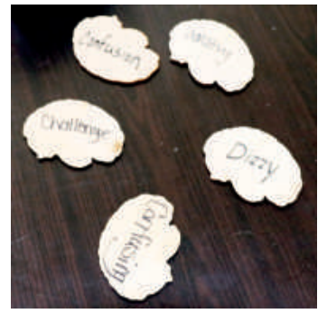
After completing the 10-minute exercise, they were given a wood cutout in the shape of a brain and asked to describe how it made them feel in one word or phrase (above).