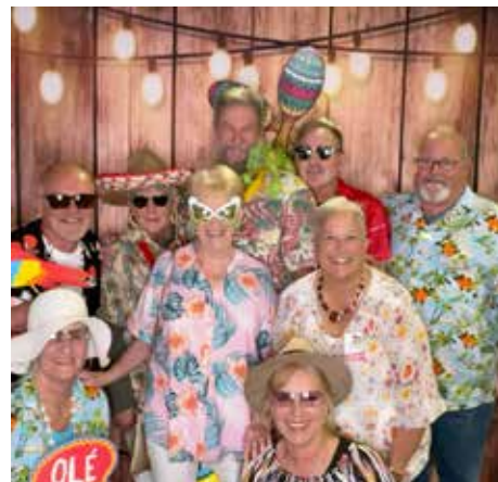
The "island style" photo booth with fun props was a huge hit. Picture It Now Photo Booths donated the booth.