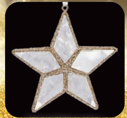
Metal Glitter Star Giving Level: $150