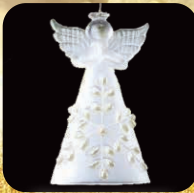
Glass Snow Angel Giving Level: $75