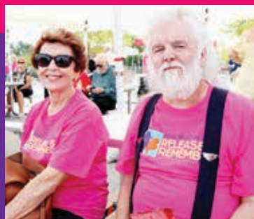
ase & Remember T-shirt to commemorate the day. photo Booth Rental in Independence as well as the photo op.