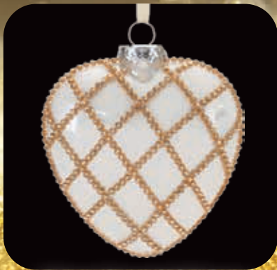
Glass Beaded Heart Giving Level: $250