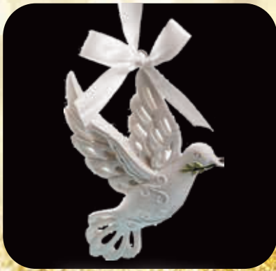
Dove of Peace Giving Level: $35