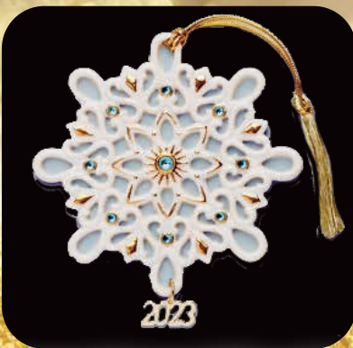
Lennox Gemmed Snowflake Giving Level: $500 Sponsored by Tenenbaum's Jewelry - Waverly