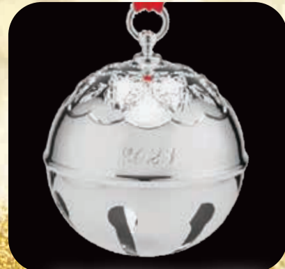
Reed & Barton 2023 Silverplated Holly Bell Giving Level: $1000+ Sponsored by Roth Jewelers - Waterloo